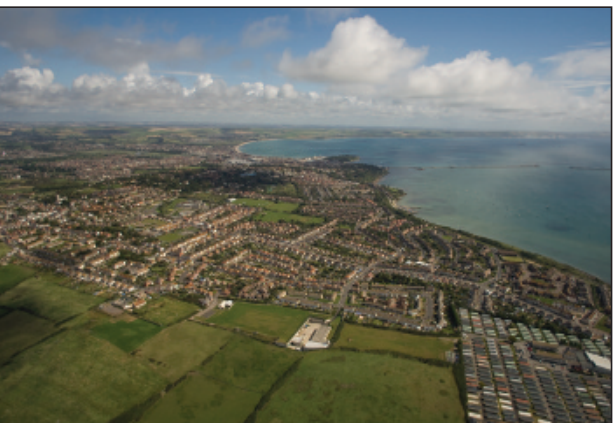
East over Wyke Regis towards Weymouth, with Portland Harbour on the right and the sweep of Weymouth Bay in the distance.