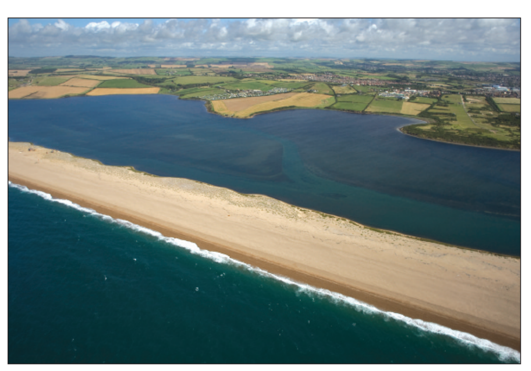
The seventeen mile thread of shingle which makes up Chesil Beach, encloses the tranquil waters of The Fleet lagoon.