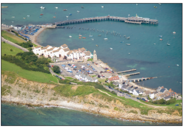
Peveril Point guards the western entrance to Swanage Bay.