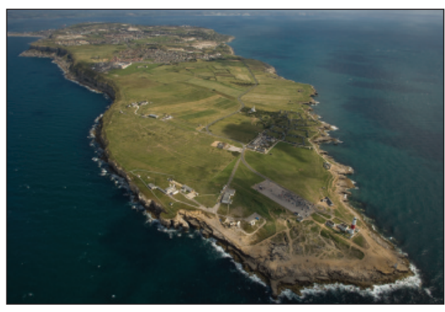
Looking north along the whole length of Portland, with the famous lighthouse at Portland Bill in the foreground.